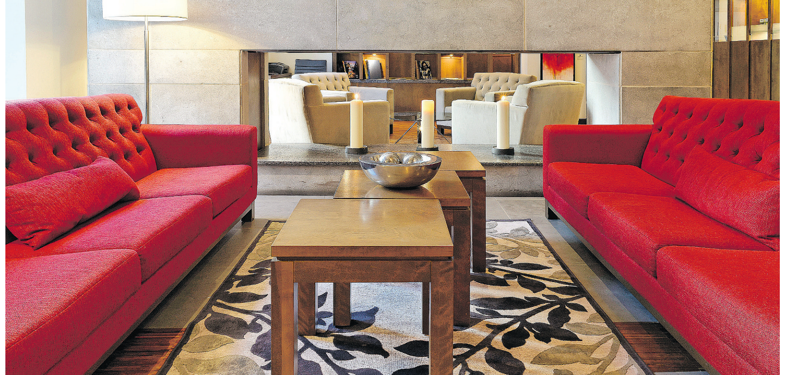
Hôtel 71, a contemporary 60-room boutique hotel in Old Quebec, has a fresh and minimalist look.